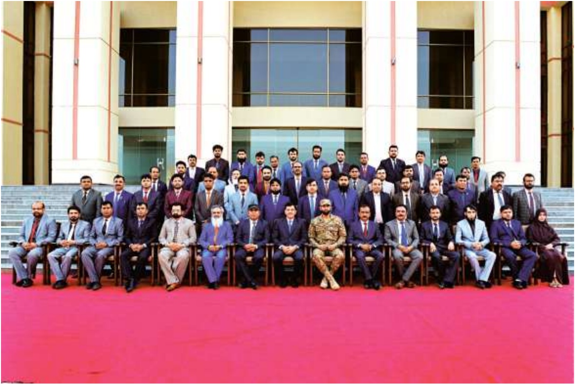
Faculty of Cadet College Larkana